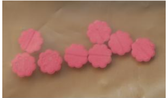
Pink pills believed to be the Class A drug ecstasy

Drugs: Police officers arrested a 29-year-old local man found to be in possession of a number of pink pills, believed to be the Class A drug ecstasy. The man was subsequently charged with possession with intent to supply and the case is currently progressing through the judicial system.