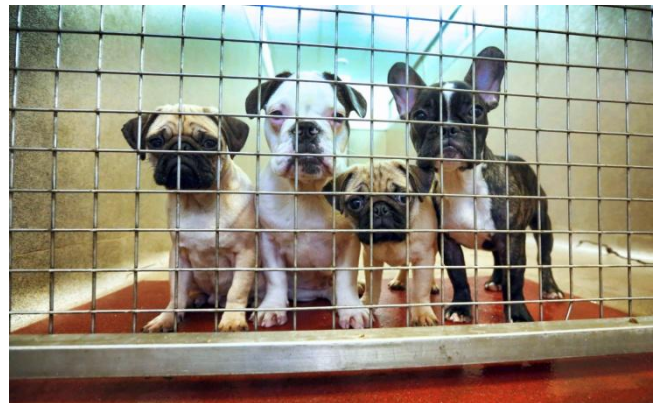
Some of the rescued puppies - photograph courtesy of the Guernsey Press

Animal cruelty: A 59-year-old man and 27-year-old woman were arrested after concerns for the welfare of 25 puppies being transported from Slovakia to the UK via Guernsey. The man was found guilty of animal cruelty and fraud and was fined £2,500. The puppies were rescued and rehomed.