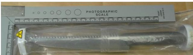
One of the knives used in the domestic incident

Domestic incident – knives: Police were called to a domestic incident in the early hours. On arrival they were met by a 27-year-old man wielding two large knives, who was threatening to harm himself and officers. After a period of negotiation armed officers deployed less lethal options (Taser) and the man was safely arrested. The man was later charged with public order offences.